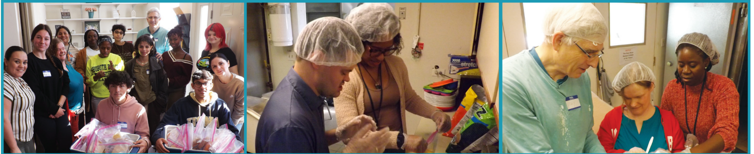
Royer-Greaves sandwich makers along with students from Delaware Valley Friends School, who volunteered to help.